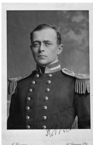
ROBERT FALCON SCOTT

Born June 6th, 1868 near Plymouth and died March 29,th 1912